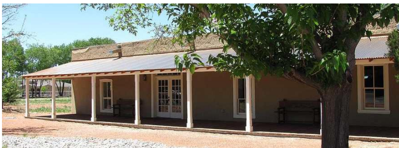
Historic Gutierrez Hubbell House

* Reserve your N-CSA Banquet Meal! The N-CSA business meeting will start at 5 pm and a buffet style dinner with soft drinks included will follow soon after. (See menu below.) Reservations are limited (and required) so sign up now. Price per person is $20.00. Reserve your space by going to this link: https://square.link/u/CiY248IY or email Julia at jalzofon@q.com or phone Julia at 505-473-7006 (okay to leave voice mail). Include your name, contact information and the total number of reservations required.